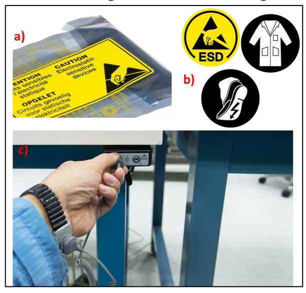
Figure 2: ESD-conform handling of encoders

A Nevertheless: From unpacking to mounting – all encoders should always be handled ESD-conform in order to exclude damages. Take the following measures into account: